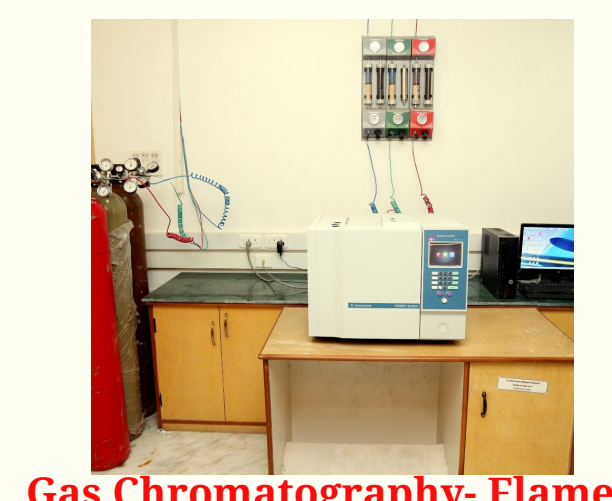
Gas Chromatography-Flame Ionization Detector & Thermal Conductivity Detector (GC-FID/TCD)